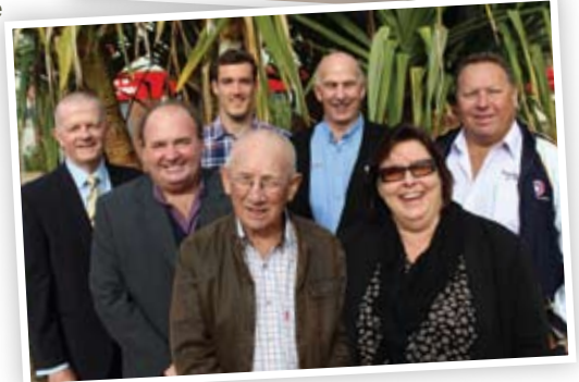
Top: The whole crowd cheers at the Volunteer of the Year award launch at Marcoola Community Bank® Branch of Bendigo Bank - June 27 2013.