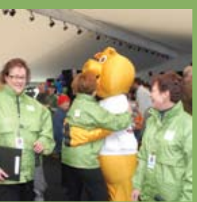
From top to bottom