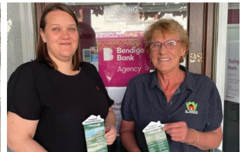
St Arnaud Neighbourhood House