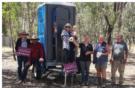
Stuart Mill Racecourse Riding Club