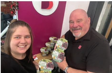
Local Food Pantries