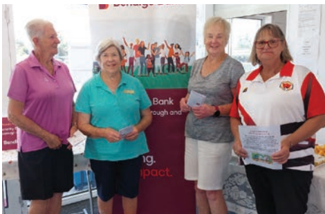
Carisbrook Bowling Club