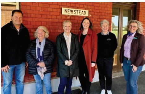
Castlemaine Maryborough Rail Trail