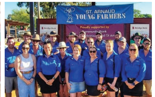
St Arnaud Harvest Festival