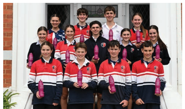
From top: Avoca Primary School, Carisbrook Primary School, Highview College