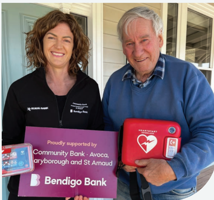
Stuart Mill Progress Association – Defib Grant

Keep reading to see the difference you've helped create!