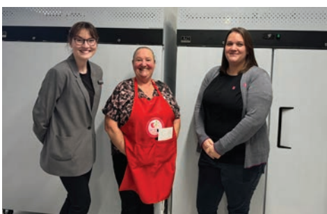
St Arnaud Community Kitchen