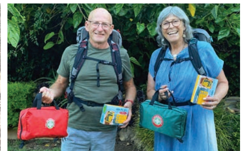
Central Goldfields Bushwalking Group