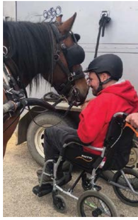
RDA Carriage Driving