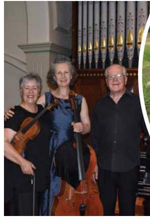
St Johns Recitals