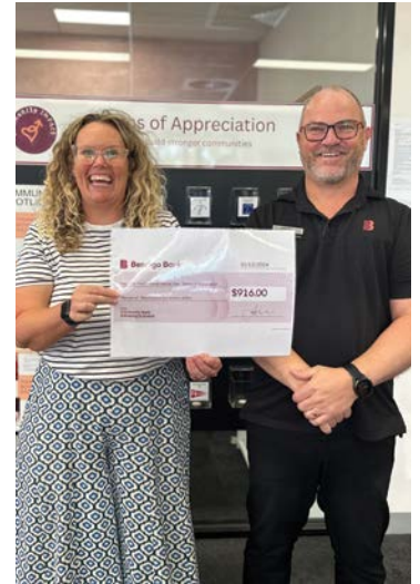
Crib Point Football Netball Club

Community banking – profit with a purpose.