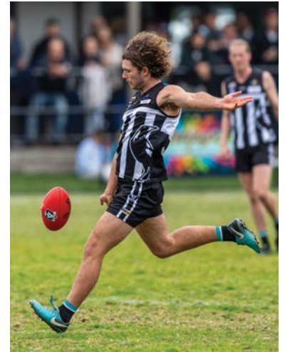
Crib Point Football Netball Club

Certification does not change our corporate structure or how we operate as a franchisee with Bendigo Bank, as it is an external process acknowledging Balnarring & District Community Services Limited as a social enterprise, which will work closely with like-minded companies and groups to ensure all people, places and our planet, thrive.