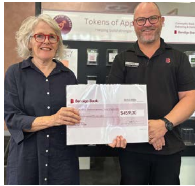
Merricks Coolart Catchment Landcare Group