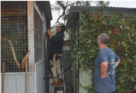
Misting system being installed