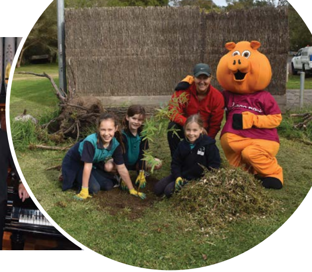
Merricks Coolart Catchment Landcare