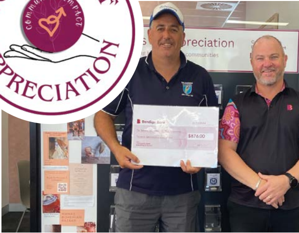
Balnarring Junior Football Club