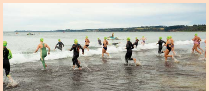
Boxing Day Swim Classic