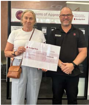
Point Leo Surf Life Saving Club