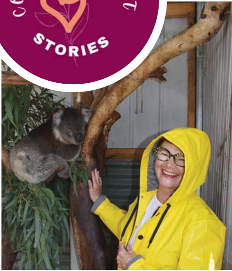
Director Susan checking the effectiveness of the system and meeting a very relaxed and cool old male patient