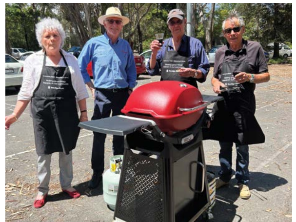
Your Community Bank funded a new barbeque, along with some of our aprons, for members of Somers Petanque Club to enjoy some after-game socialising.