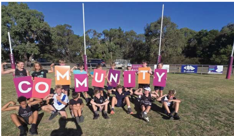
Protective goal post padding funded by your Community Bank keeps young players at Crib Point Junior Football Club safe. Community is the name of the game!

Did you know that Willum Warrain Aboriginal Association in Hastings has two successful social enterprises - the Willum Warrain Bush Nursery, which is open to the community and Cultural Immersion Tours and Cultural Awareness Training, both of which provide employment opportunities and share culture with the broader community.