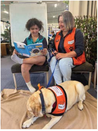
Story Dog Ruby