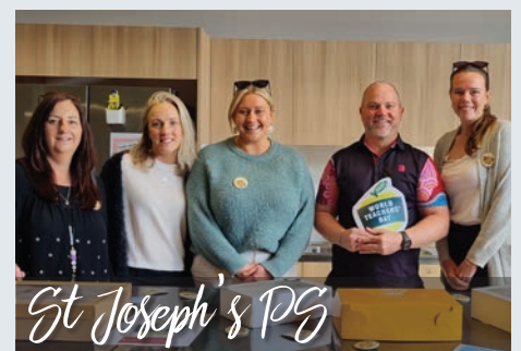
St Joseph's PS