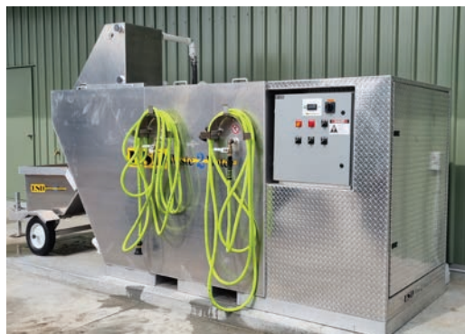
◀ The new wash-down system at Flinders Golf Club, to which we contributed significant funds. This ensures no environmental risks from equipment washdowns and the production of recycled water for course use from all washdown activity.