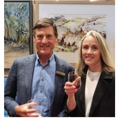
▲ We were thrilled to again be a major sponsor of the wonderful Flinders Art Show after a four-year hiatus. Over $40,000 was raised, which will support local programs including Western Port Community Support, Southern Peninsula Children's Research Institute, Food for All and the Flinders CFA.