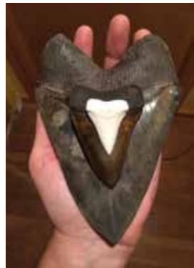
The 'three bears' of shark teeth.

It's true! Five million years ago extinct fauna such as Diprotodon (giant wombats) and the largest predator whales roamed Bayside and its waters. Beaumaris Bay and Ricketts Point Marine Sanctuary are rich fossil heritage areas and at the annual Fossil Expo in September, more than 200 people gathered to have their fossils identified and to learn all about our previous tenants.