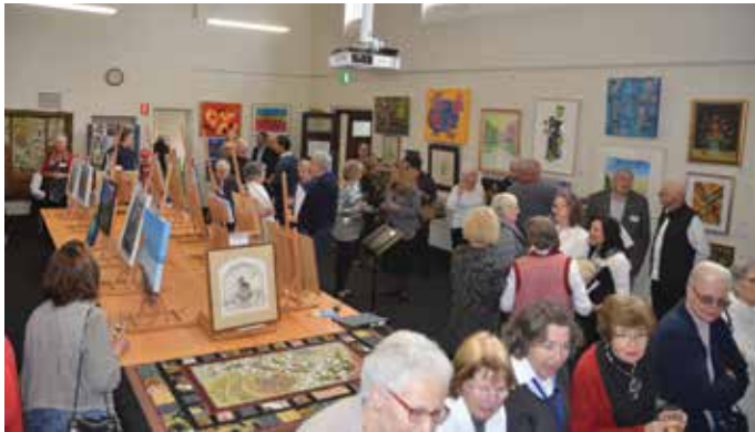
Come along to the Bayside U3A Art and Craft Exhibition.

Enquiries: 9589 3798 or email baysideU3A@gmail.com