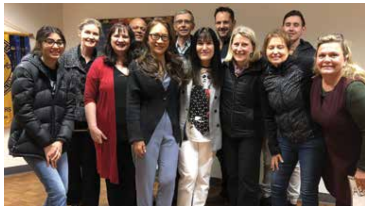
Members of Sandbelt Toastmasters Club.