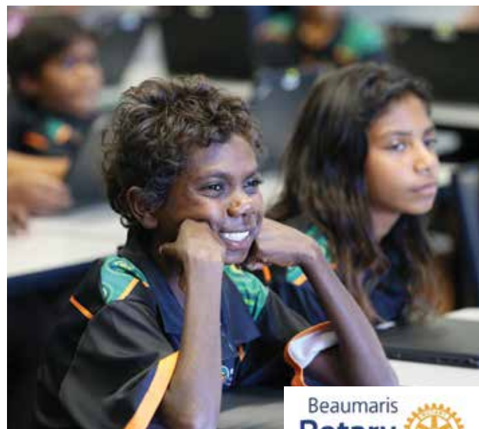
MITS students in class