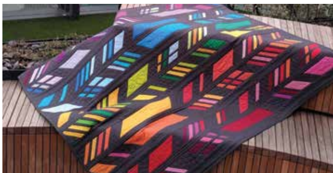
'Birds of a Feather' raffle quilt by members.