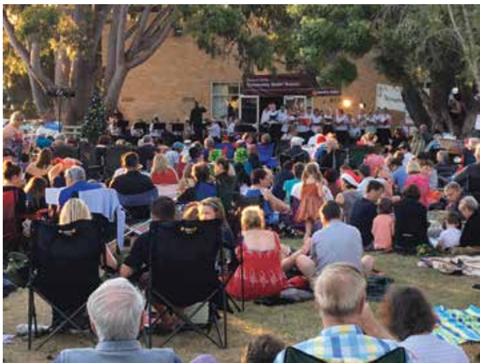
The crowd enjoys an evening of festive cheer.