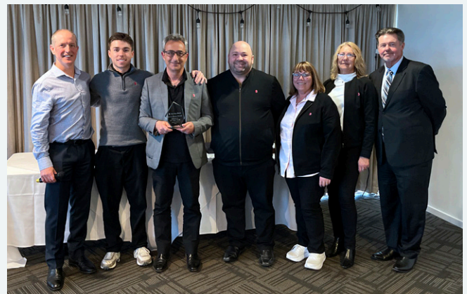
Team members from Community Bank Carrum Downs picking up their award for Branch of the Year.