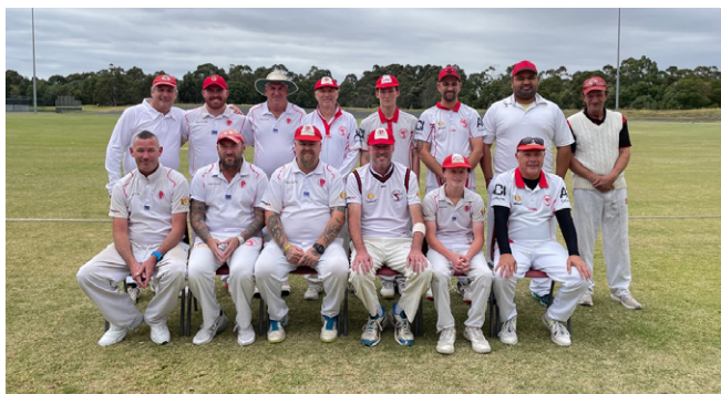
Merinda Park Cricket Club