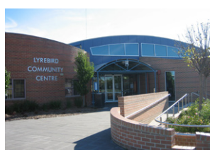
Lyrebird Community Centre