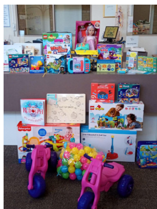
Frankston Toy Library