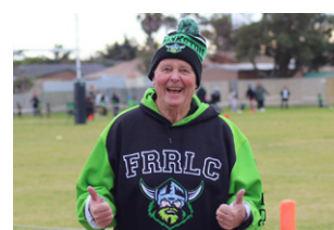
Frankston Raiders Rugby League Club