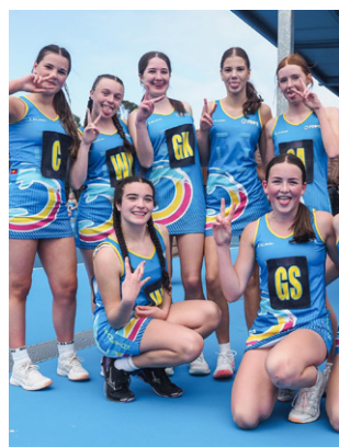
Frankston & District Netball Association