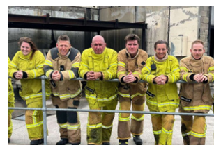
Skye Fire Brigade (CFA)