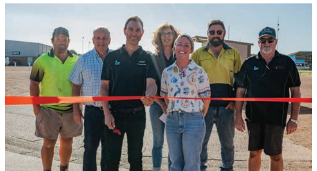
Top left: Cummins Golf Club presentations. Middle left: Cummins & District War Memorial Swimming Pool – Community Investment funding, and Great Flinders Southern Eyre Junior Cricket trophy winners. Left: Youth Opportunities Program – Cummins. Above: Cummins Memorial Recreation Centre opening.