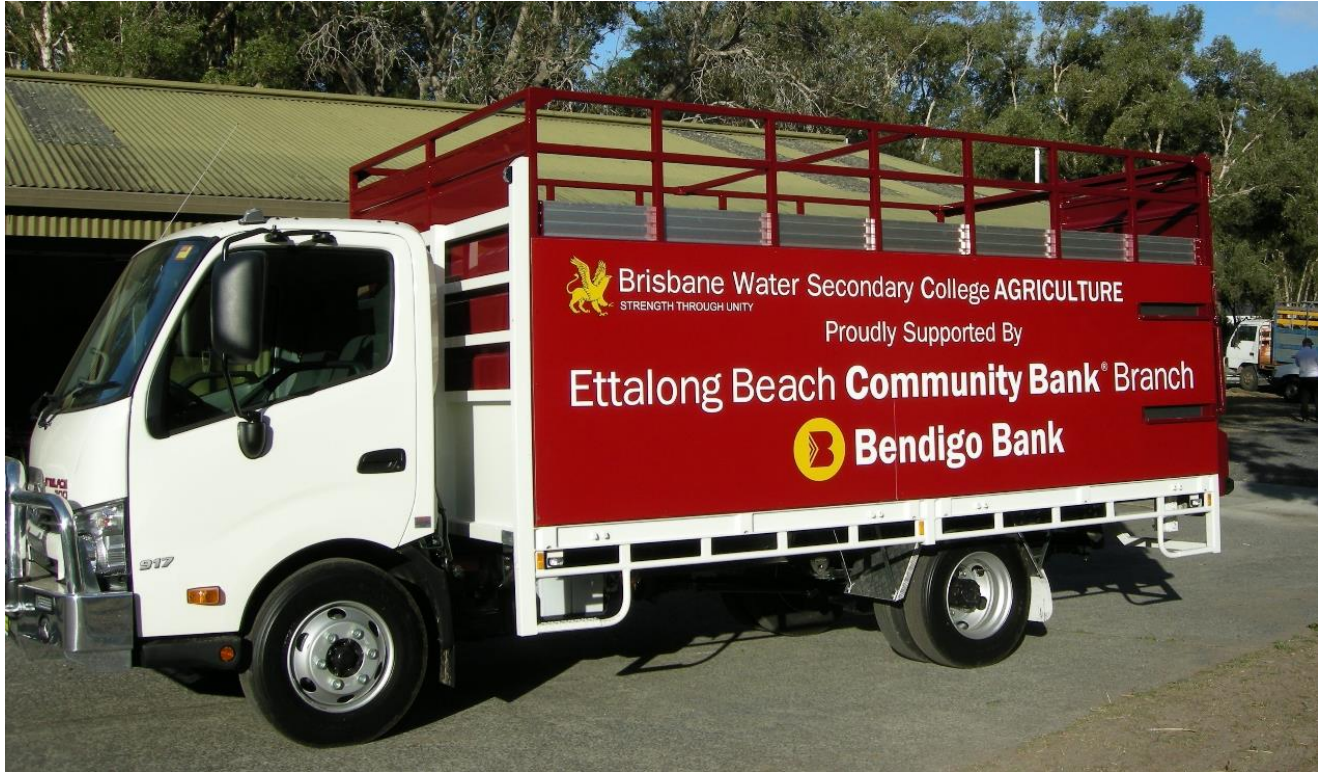
Truck purchased for the Agricultural Classes at Brisbane Water Secondary College

Ettalong Beach Community Bank® Branch 263-267 Oceanview Road, Ettalong Beach NSW 2257 Phone: (02) 4344 4206