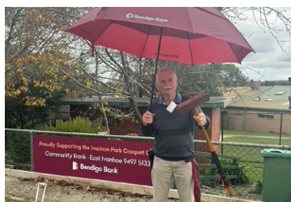
We're proud to support the Ivanhoe Park Croquet Club