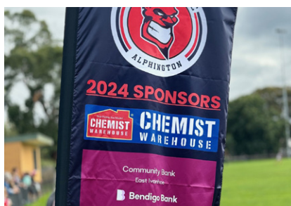
Parkside Junior Football Club are one of our latest sponsorship recipients