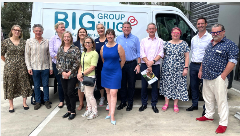
The board and senior executives of Bendigo Bank visit local charity Big Group Hug

They had the opportunity to see first-hand the committed army of volunteers who provide material aid to children and families in need. We are proud to have supported Big Group Hug since they started their journey 10 years ago and will continue to do so for many years to come.