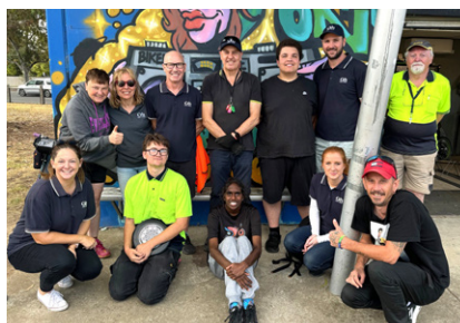
The team from Open House Backyard Sports meet at Malahang Reserve in West Heidelberg every Thursday after school

The team have a bike repair service which they offer free of charge, and are always looking for second hand bikes to repair and re-gift. If you have one in your garage that needs a new home contact the team at Open House on 9459 7083 or email office@ohcic.org.au .