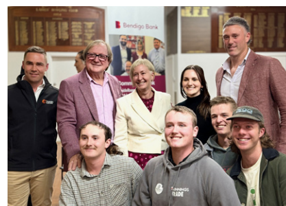
Community Bank East Ivanhoe reps with the team from Carpentry Australia and Ambassador Kevin Sheedy AO

We're proud to support Carpentry Australia.