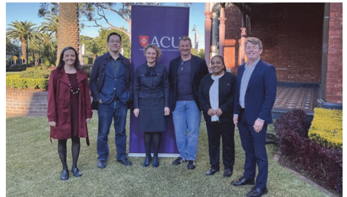
Above: the start of the collaboration between the Australian Catholic University and the Community Bank