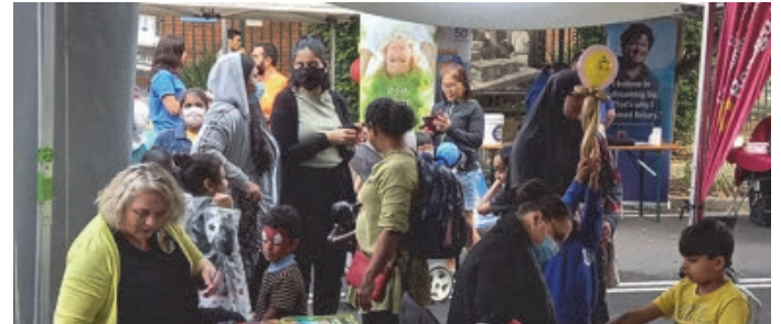
Above: supporting Council's Homebush Vibes Event

Community Bank Homebush Founders Scholarships Breakfast Point Men's Shed Local Seniors Clubs Strathfield Council Community Events Plus many more!