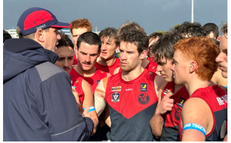
Mt Eliza Football Netball Club