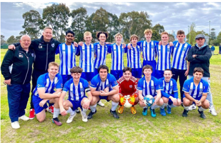
Baxter Soccer Club