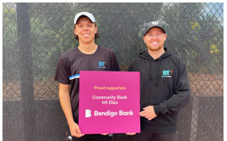
Mt Eliza Tennis Club