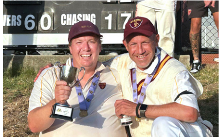
Delacombe Park Cricket Club