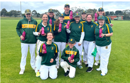
Mt Eliza Cricket Club