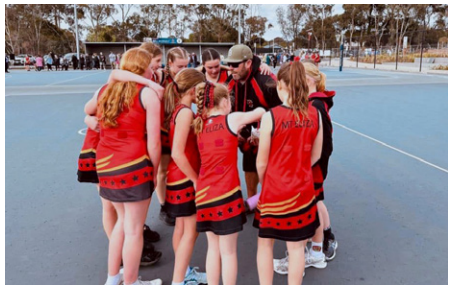
Mt Eliza Netball Club