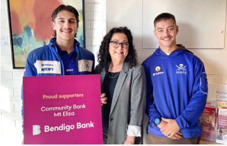
Old Peninsula Football Club