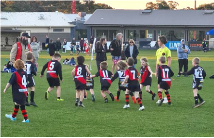
Moorooduc Junior Football Club