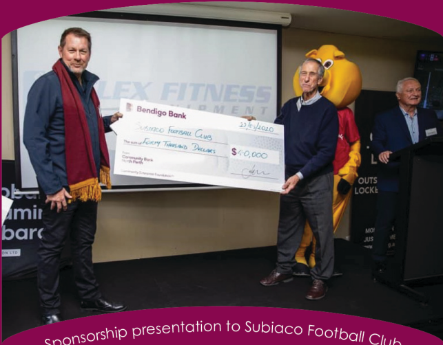
Sponsorship presentation to Subiaco Football Club