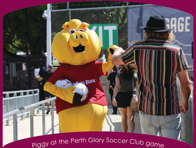
piggy at the Perth Glory Soccer Club game