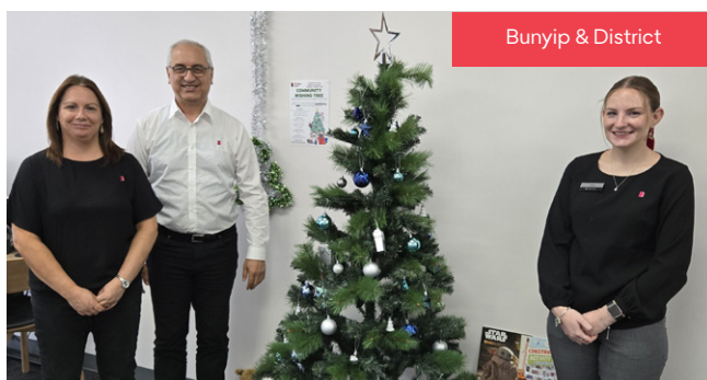
Bunyip & District