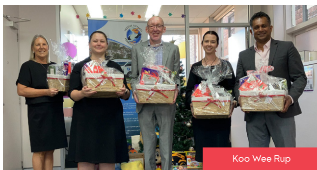
Koo Wee Rup