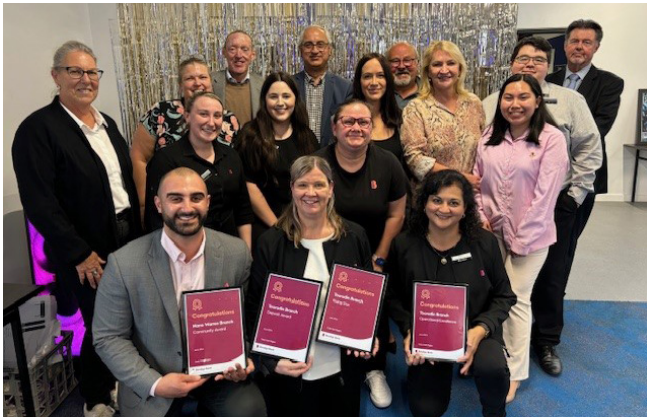
Some of our staff at the Region Awards Night in November.

Thank you to our staff and customers for being part of this journey—here's to more big achievements ahead!