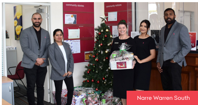
Narre Warren South