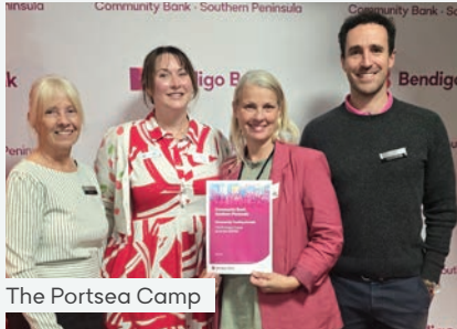
The Portsea Camp