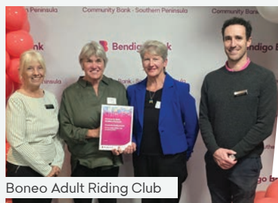
Boneo Adult Riding Club