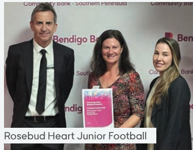
Rosebud Heart Junior Football