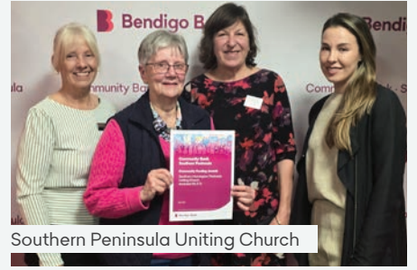
Southern Peninsula Uniting Church