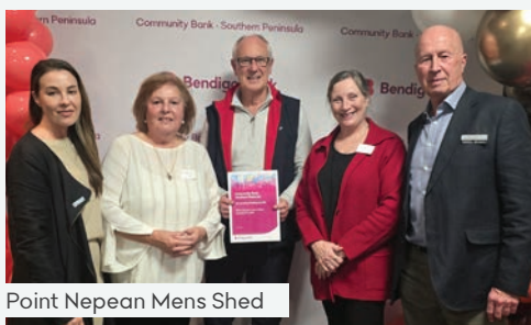
Point Nepean Mens Shed