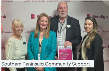
Southern Peninsula Community Support