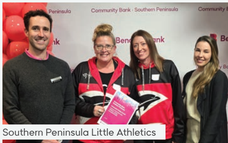
Southern Peninsula Little Athletics

COMMUNITY More than $200,000 in 2023-24 FUNDING