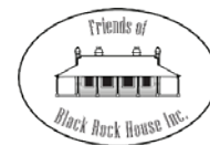
Black Rock House