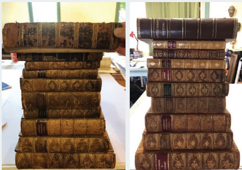
Before and after restoration of the books.