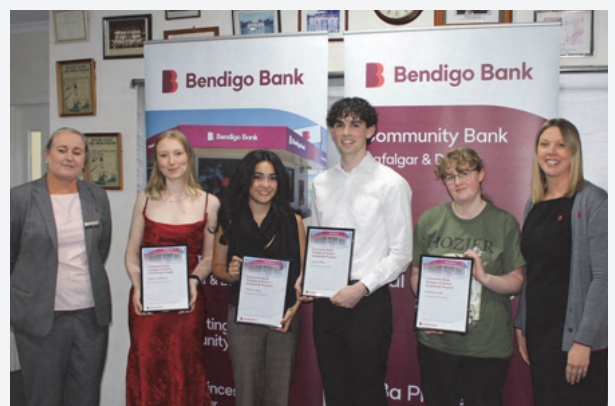
Congratulations to Our 2024 Scholarship Recipients