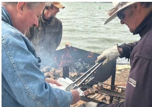
A tasty piece of BBQ Eel was a treat enjoyed by many

Our community is fortunate to have such a diverse and interesting festival right here in Lake Bolac, and we are happy to support those volunteers who make it all happen.