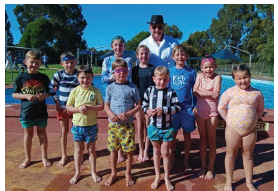
Water Bombie Competitors getting ready for the big bomb.