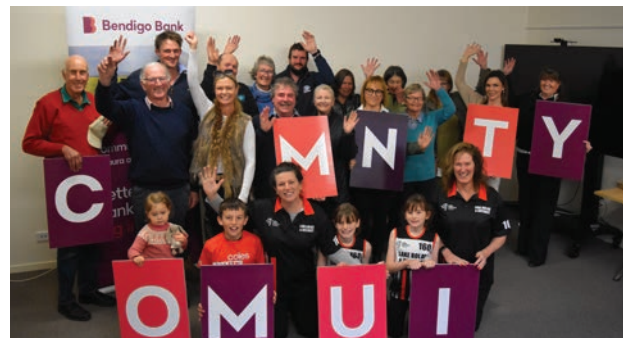
Grant recipients with Board members and staff