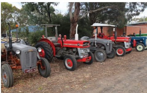
An array of vintage tractors on display kept attendees and in particular farmers enthused