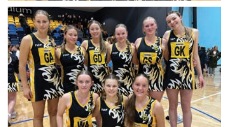
From top: The 13 and under squad, 15 and under squad, and 17 and under squad